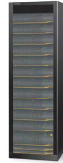
AMS1000 with NAS Option 174TB Fibre Channel and SATA 8 Gigabit Ethernet ports