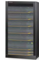
AMS500 with NAS Option 86TB Fibre Channel and SATA 8 Gigabit Ethernet ports